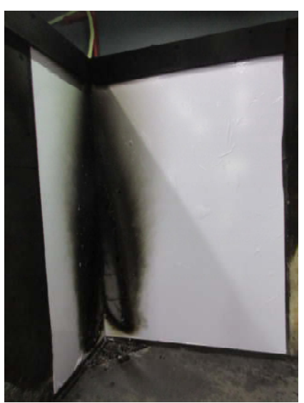
After Test (EN 13823)